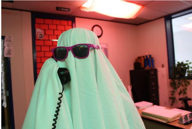
“Hold Please” by Presly Smith

Do you have a DSLR? Do you ever take it out of auto? Photo Imaging is a class geared for getting students out of auto and moving them beyond taking “snapshots”. Students have an understanding of how the exposure triangle (shutter speed, aperture, and ISO) effects photo composition and have been learning basic visual organization rules. They participated in a Silly Ghost Challenge (it’s a trendy social media thing) to put all that practice to work and staff voted on 3 top winners for each of the Photo Imaging classes. Please join me in congratulating the following for their work: